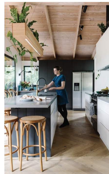
Images: Front Liefing Merlo Homes. This page: (Top & LHS Bottom) Ben Gallery Architects + Keenan Built (RHS Bottom) Sanctum Homes.