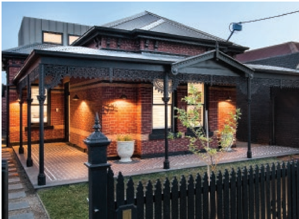
Images: This page: (Top) Ben Callery Architects + Keenan Built (Bottom) Bellemo & Cat Architects + Hatch Design & Construction.